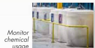
Monitor chemical usage