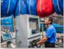
Improve process load efficiency