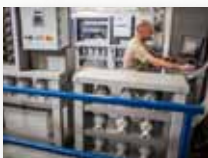
Automatic chemical injection for accurate, labor-free injection