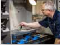
Systems are carefully manufactured to meet customer specifications