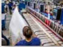
Reduce re-wash and stained goods