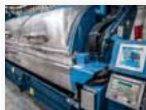
Wash aisle efficiency analysis and formula programming from a PC