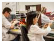
Each system has rigorous quality assurance checkpoints